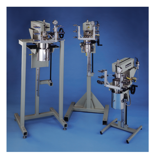
Laboratory Stirred Reactors

Pressure vessels which operate under high pressure and cyclic conditions are susceptible to fatigue-related failure. Many insurance companies and corporate safety directors agree that annual inspections, including a liquid penetrant examination, are necessary to evaluate the integrity of a vessel. To assure continued safe operation of your high pressure vessels, and as a standard component in vessel refurbishment Parker Autoclave offers vessel inspection, analysis and testing services. In addition to vessel inspection, Parker Autoclave will recalibrate and recertify all system mechanical and electrical instrumentation. Testing and recertification can be conducted on-site or at our facility and involves only the use of test equipment traceable to the National Bureau of Standards.