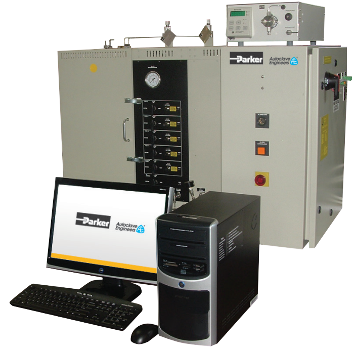
BTRS-JR® PC - Bench Top Reaction System

Parker Autoclave encourages all customers to review the recommended spare parts list supplied with your new equipment. These lists are based on actual user experience. Maintaining an inventory of all or some of these parts can help minimize downtime should a problem occur.