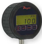
DPG-100 with Protective Rubber Boot