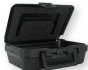
Protective Carrying Case