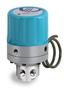
ER5110 (WITH 44-5200 SERIES REGULATOR)

TESCOM ER5100 Series consists of the ER5000 Series controller and a 44-4000 Series pressure reducing regulator integrated together. Inlet pressures are up to 4500 psig / 310 bar with two different outlet ranges of 400 and 900 psig / 27.6 and 62.1 bar. The ER5100 Series may be ordered with a C_V = 0.7 or a C_V = 2.0 . This series offers fast accurate control in applications requiring continuous flow. Also available with the 44-5200 Series regulator (ER5110).