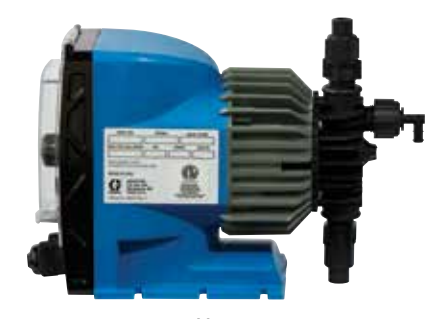
Mongoose™ PVDF Head