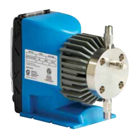
Mongoose™ Graco Check Valve on SST models