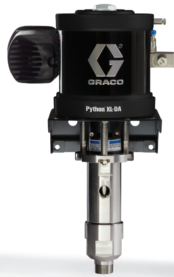
Python XL-DA 4.5"