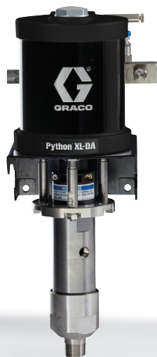
Python XL-DA 3.5"