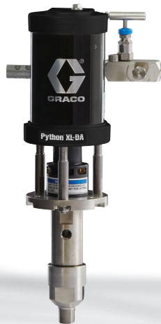
Python XL-DA 2.5"