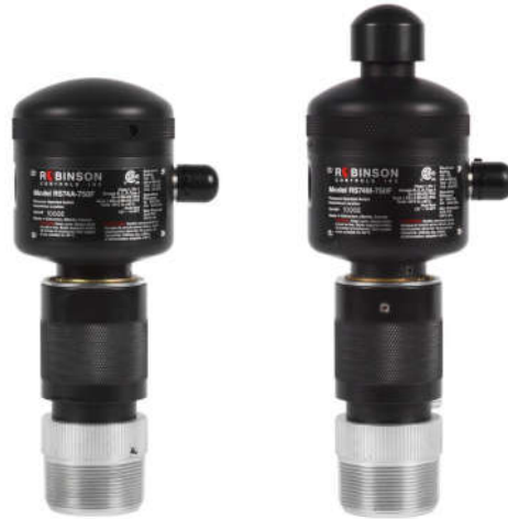
RS74A-750F Auto Reset