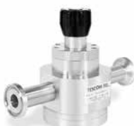
PH-1800 Low Pressure Very High Flow

All Pharmpure™ regulators are compliant with the MJ and SF sections of BPE-2009. Clean Service Certification option is available.