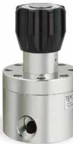
26-2500 High Flow