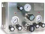
NA-4 Changeover System