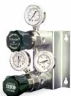
CS2200 Changeover System