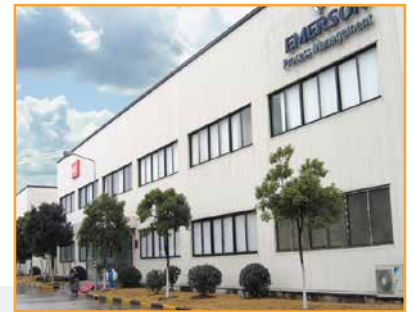
ASIA PACIFIC Pudong Shanghai, China