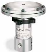
Air Actuator (26-2000 Series)