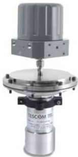
ER5000 / 26-2000 Series