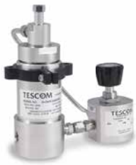
56 Series Flow Control