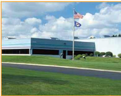
NORTH AMERICA Elk River, Minnesota USA