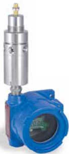
44-5800 Electric Heated Vaporizing