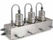
Auto Cascade System