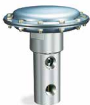
54-2800 High Flow/ High Pressure