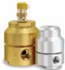
VA & VG Air-Operated ON/OFF Valves