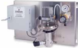
ER5K Kit Panel Assembly Pressure Reducing