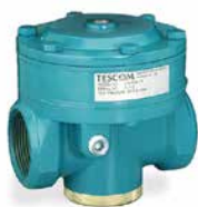
269-529 Low Pressure/ High Flow Regulator