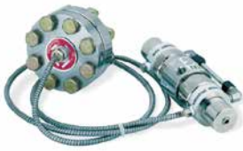
42 MW Welded Diaphragm Instrument Isolator (shown with the SJS Series regulator)