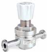
PH-3200 - Medium Flow

All Pharmpure™ regulators are compliant with the MJ and SF sections of BPE-2009. Clean Service Certification option is available.