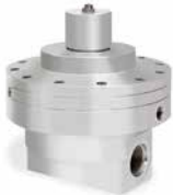
20-1400 High Flow/ Low Pressure