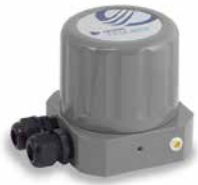
ER5000 Digital Pressure Controller