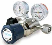
SG1 (with accessories)