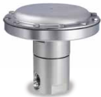
54-2900 Series High Flow/Back Pressure