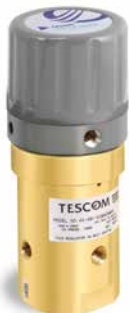
ER5100 Series High Flow Control