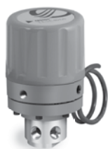
ER5110 Compact Integrated Unit