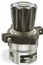
26-2300 High Accuracy