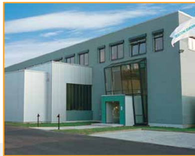
EUROPE Selmsdorf, Germany