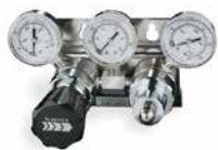
ACS012 Automatic Changeover